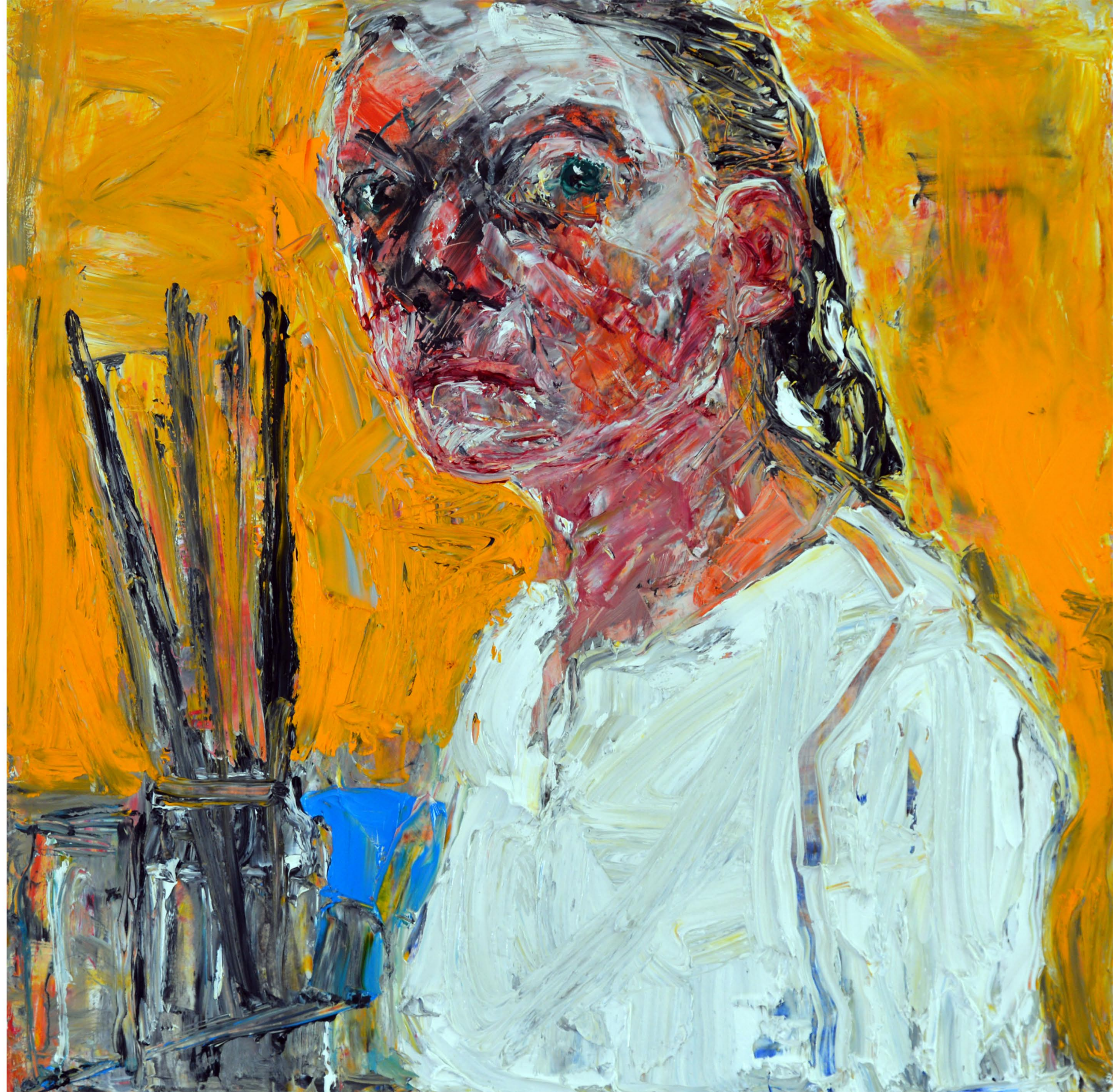
Figure against Yellow, 2018 oil on gesso, 45 x 45 cm