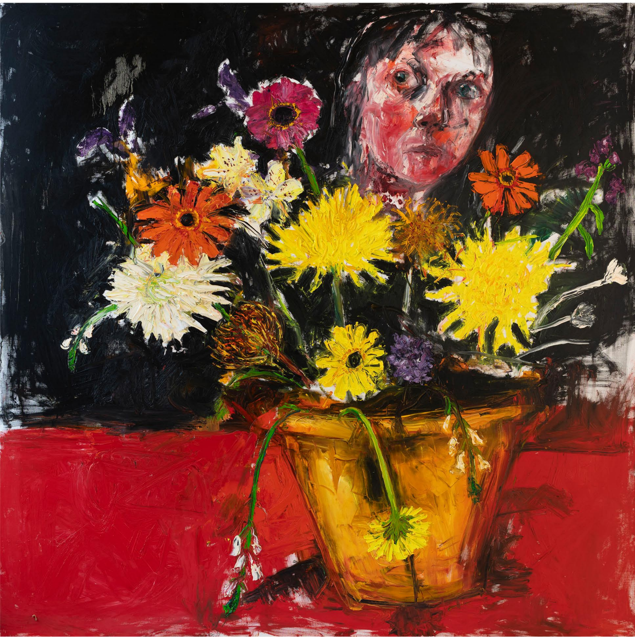
Chrysanthemums and Gerberas, 2023 oil on linen, 165 x 165 cm