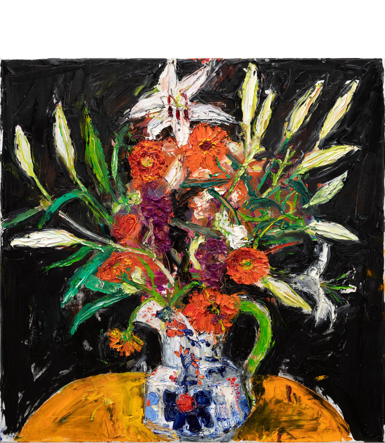
Dragon Handled Jug, 2024 oil on linen, 90 x 90 cm (detail right)