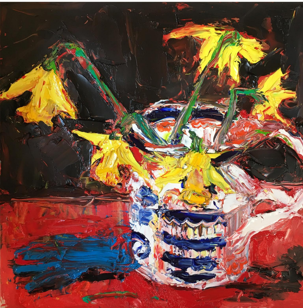
Daffodils and Glove, 2018 oil on gesso, 30 x 30 cm