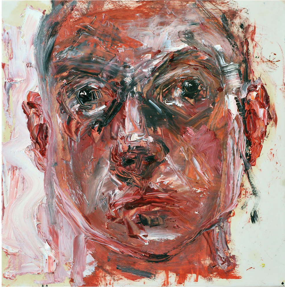
Little Head at Night, 2018 oil on gesso, 25 X 25 cm