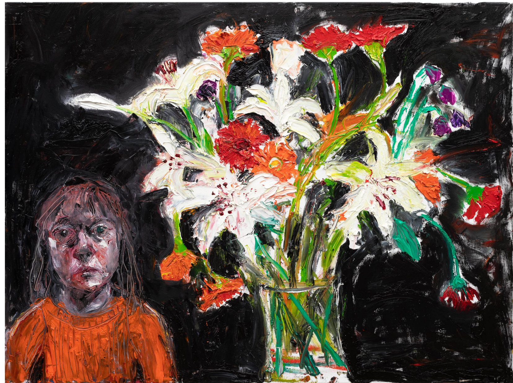
Glass Vase II, 2024 oil on linen, 76 x 102cm (detail above)