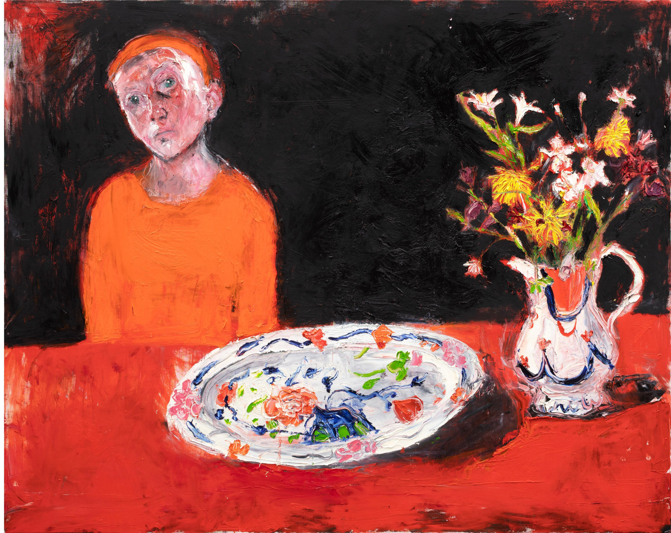
Platter on a Red Table, 2023 - 2025 oil on linen, 120 x 150 cm