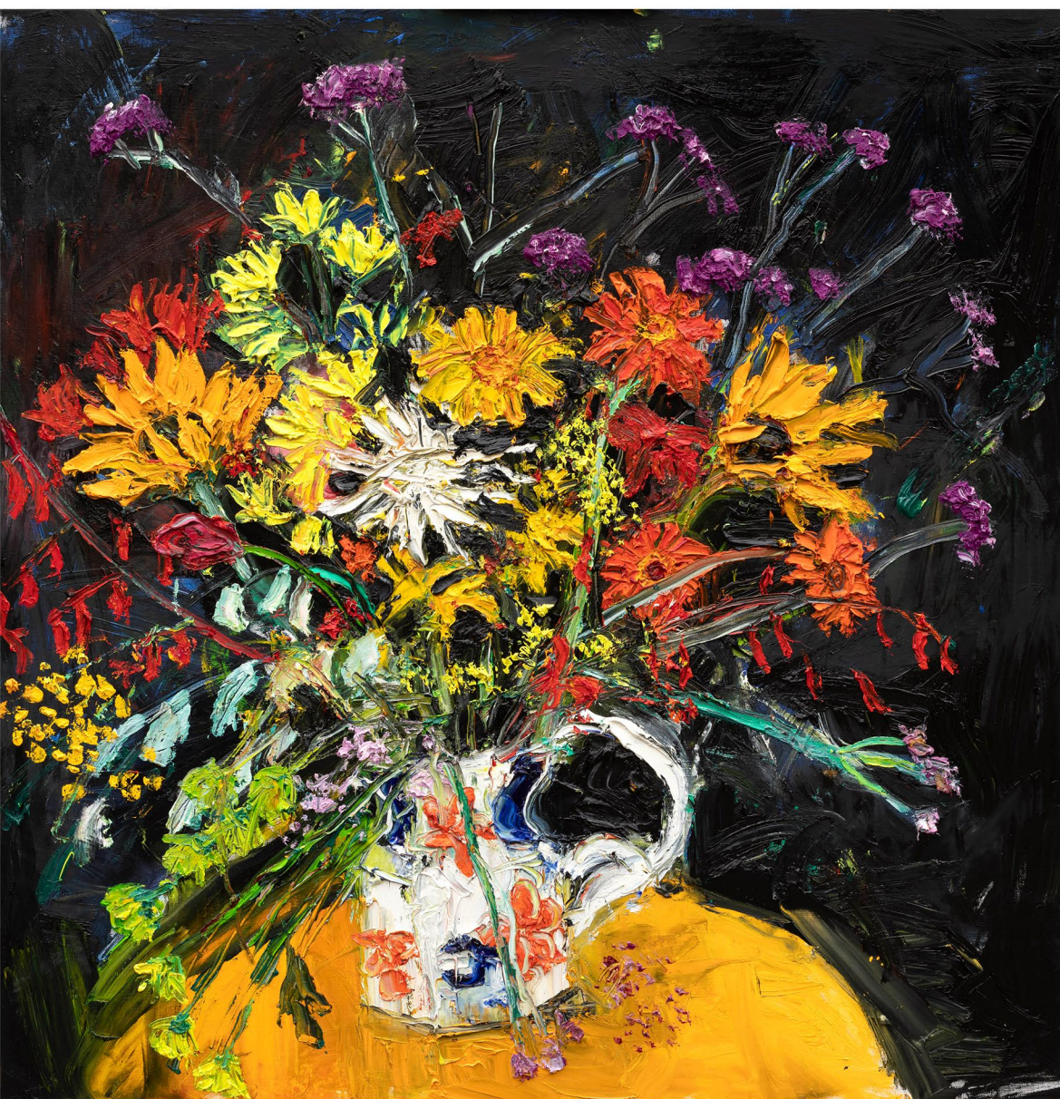
Verbenas and Indian Yellow, 2024 oil on linen 90 x 90 cm (detail right)