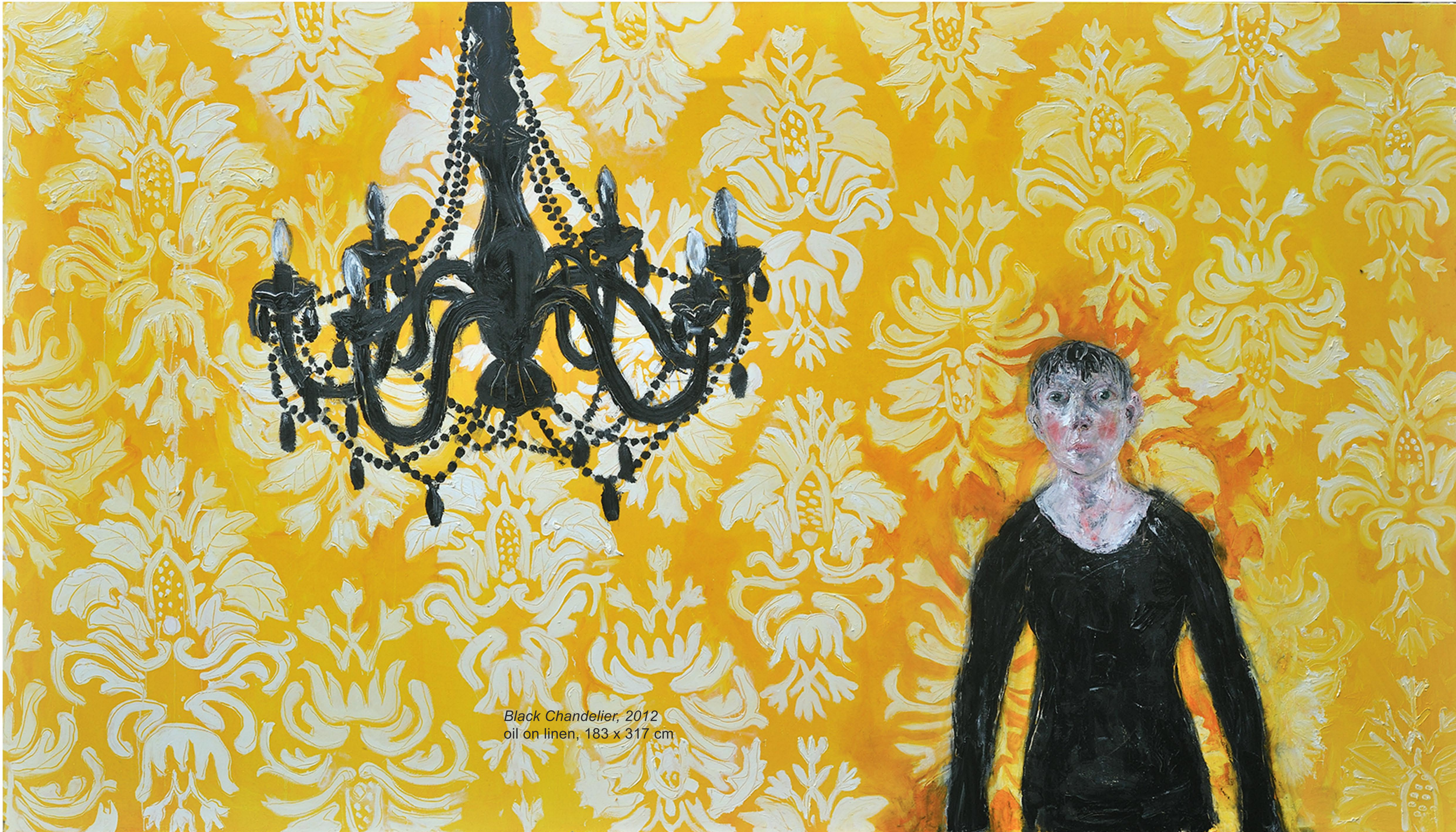
Black Chandelier, 2012 oil on linen, 183 x 317 cm