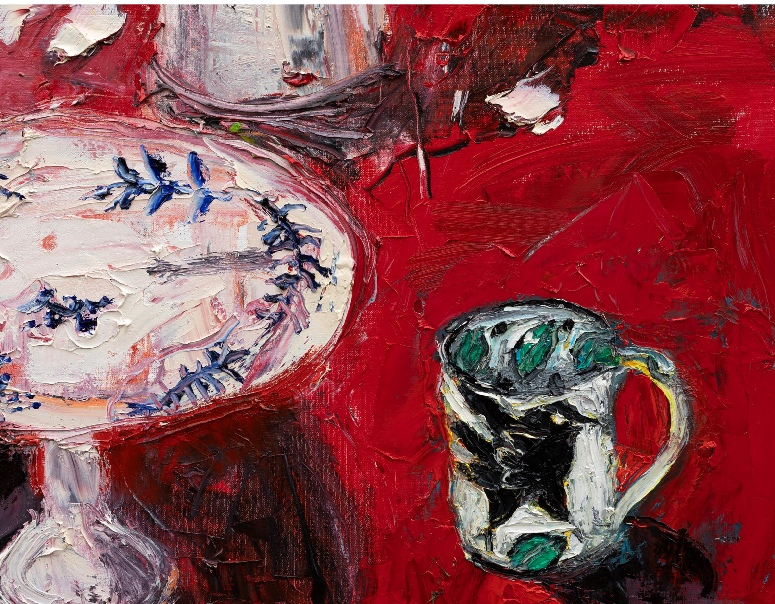
The Crow Mug, 2023 - 2025 oil on linen, 115 x 81 cm (detail above)