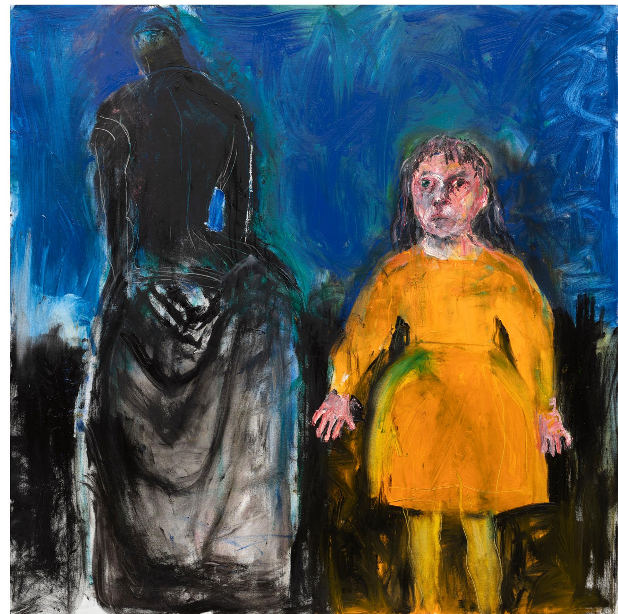
The Afternoon House II, 2024 oil on linen, 152 x 152 cm (detail left)