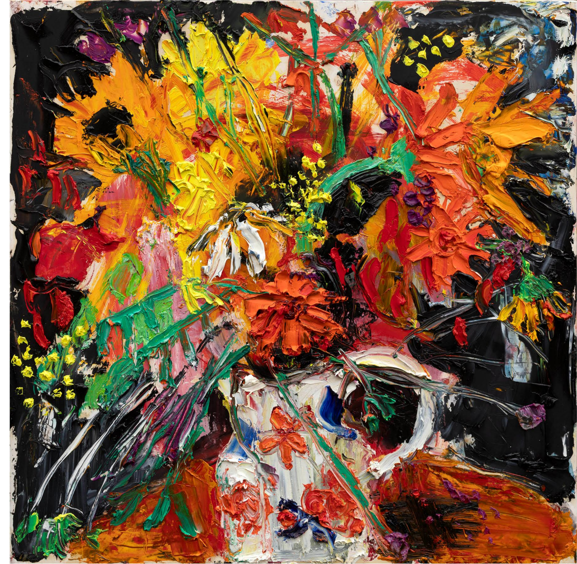
Spring Flowers, 2024 oil on gesso, 46 x 46 cm (detail left)