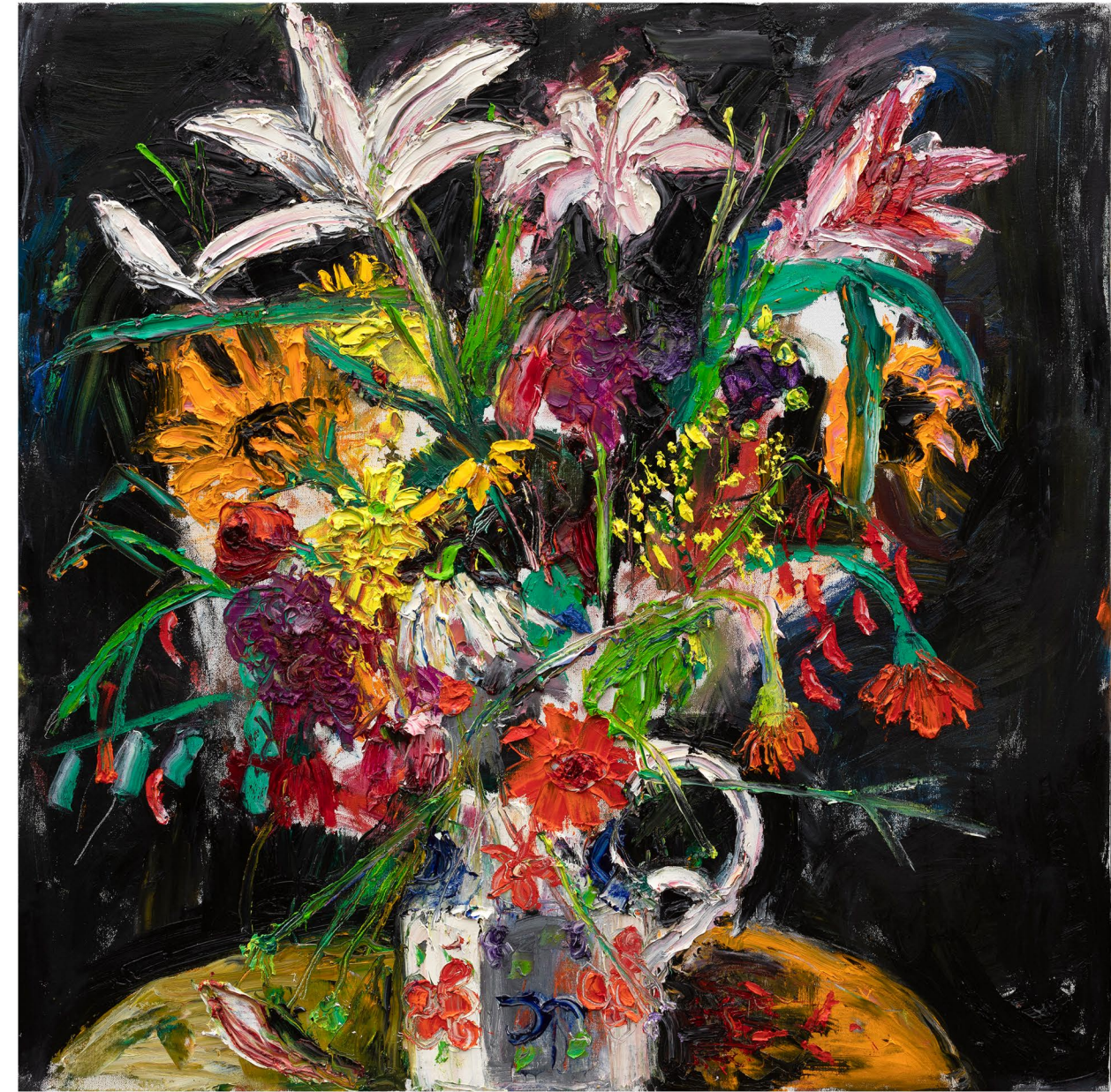
Open Lilies , 2024 oil on linen, 90 x 90 cm (detail left)