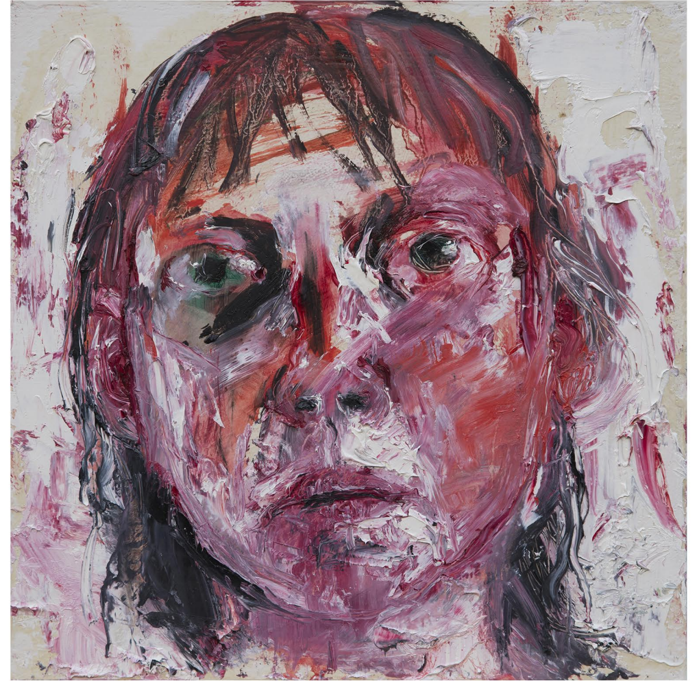
Head, 2016 oil on gesso, 30.5 x 30.5 cm