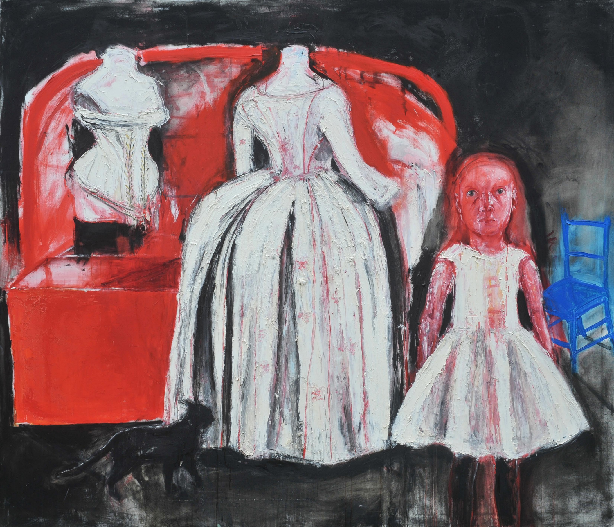
Inner Room, 1999 oil on linen, 183 x 213 cm