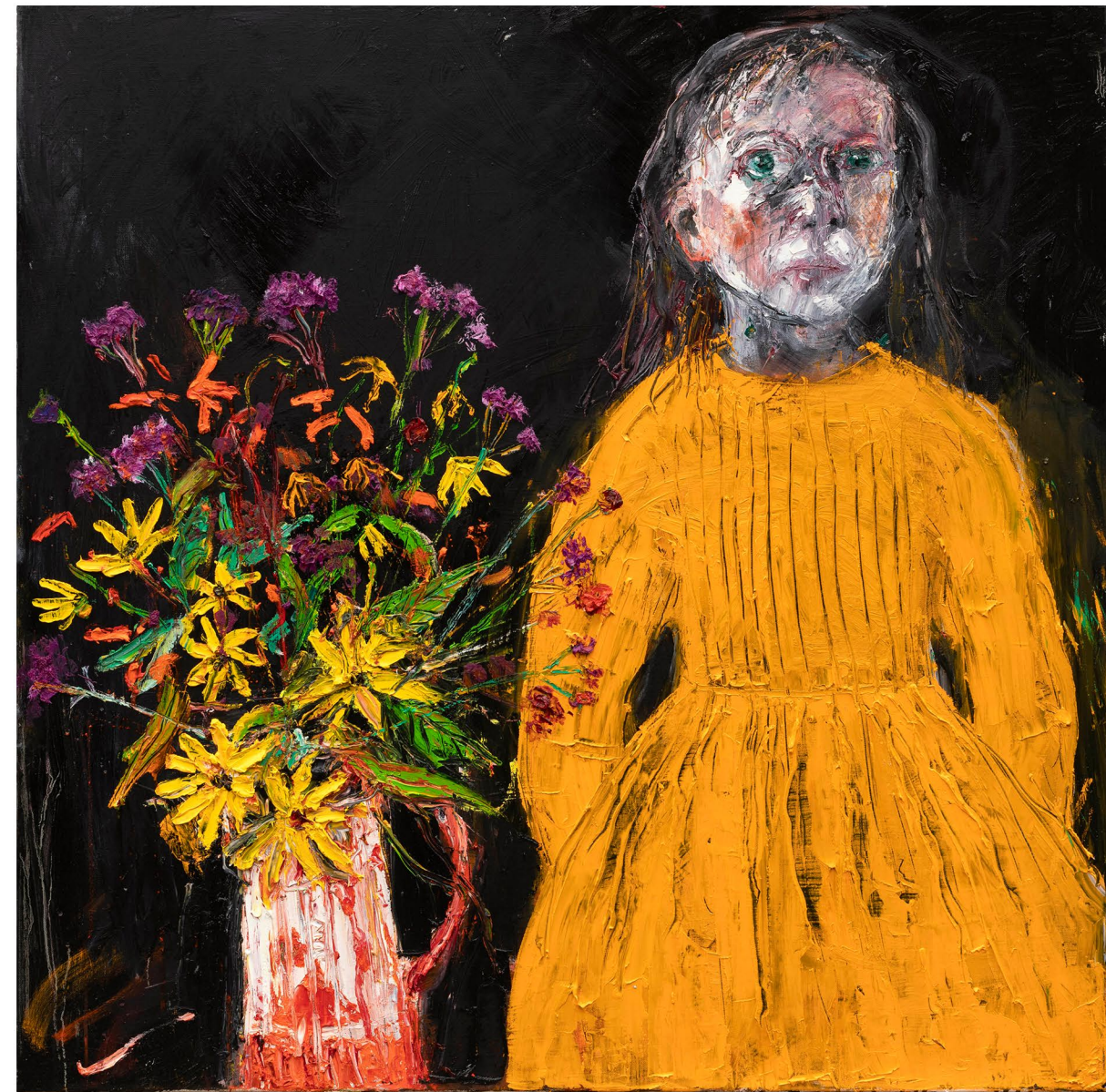
The Afternoon House I, 2024 oil on linen 90 x 90 cm (detail left)