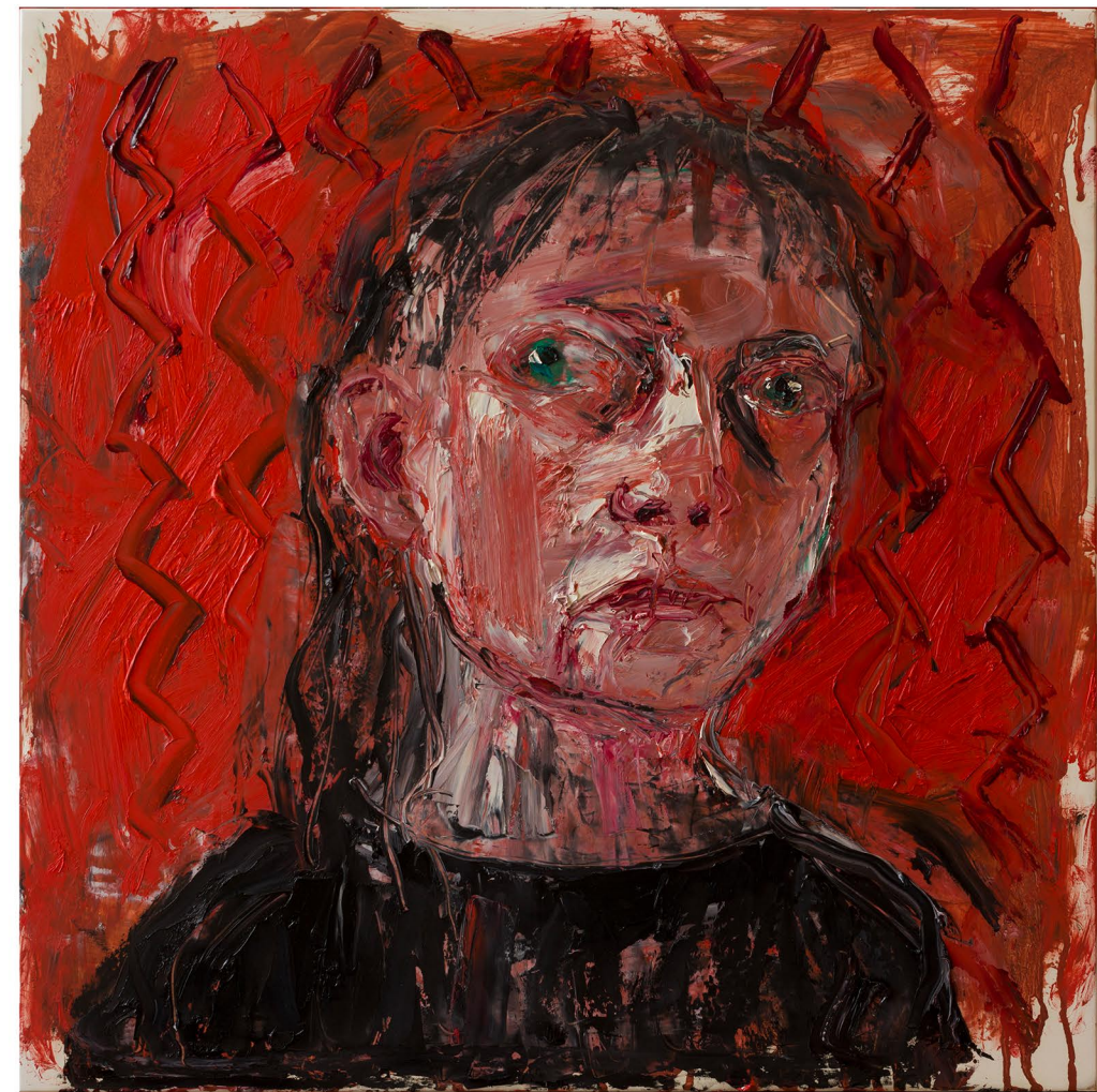
Head against Zigzags, 2021 oil on gesso, 50 x 50 cm