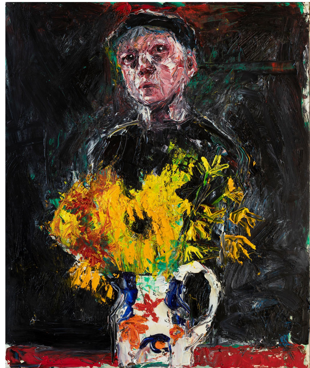
Flowers in the Studio, 2023 oil on gesso, 60 x 50 cm