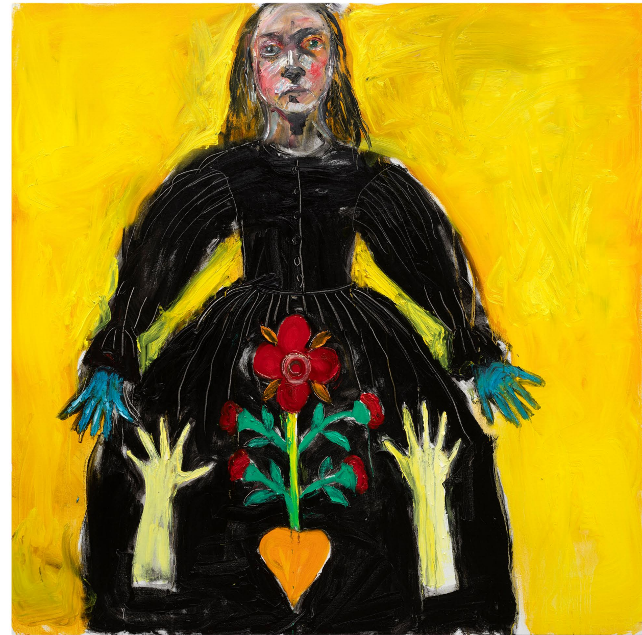
Nitrile Gloves II, 2025 oil on linen, 152 x 152 cm (detail left)