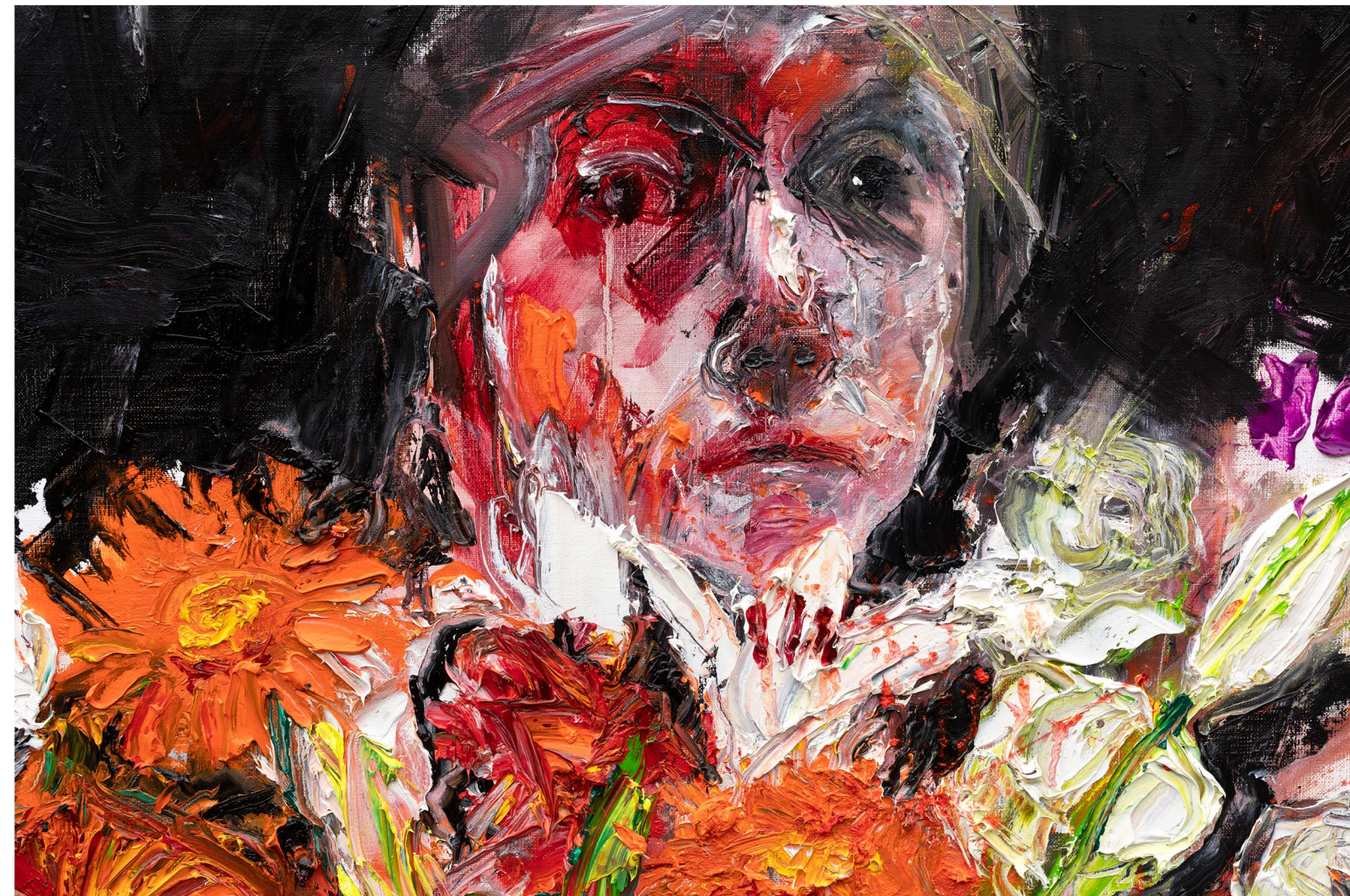
Glass Vase I, 2024 oil on linen, 102 x 76cm (detail right)